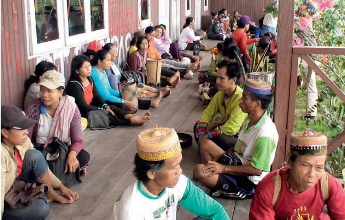
Dayak Wahea traditional community.