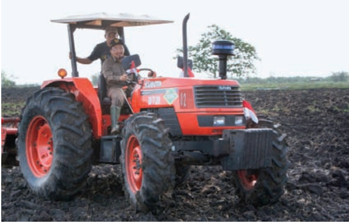
Agriculture Minister Suswono during MIFEE grand launching event in Merauke.